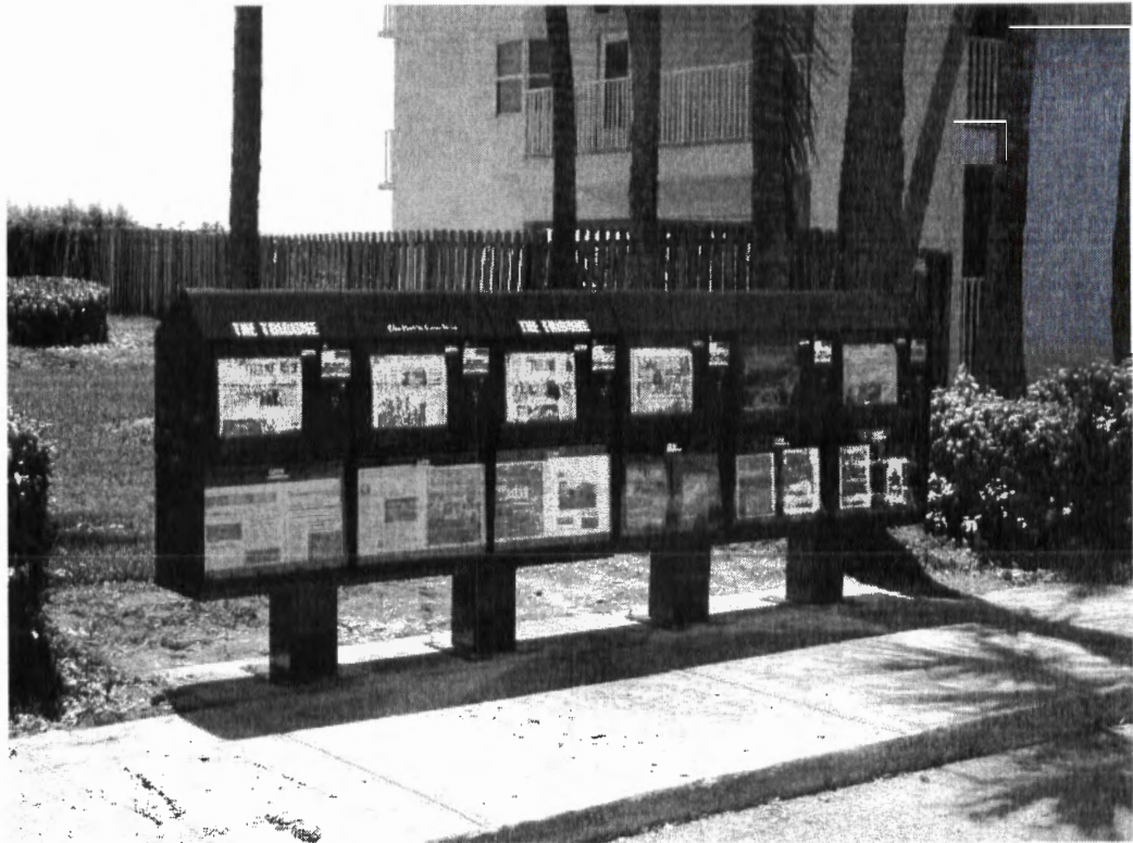
Modular Newsrack units by Rak Systems